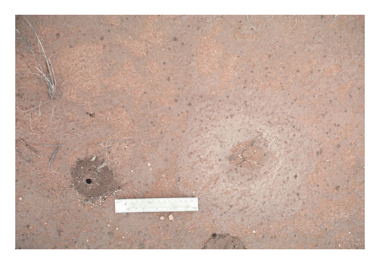
Left: Active ant mound. Right: Old ant mound.

Water storage, infiltration, and resistance to erosion.— Soil biota form water-stable aggregates that store water and are more resistant to water erosion and wind erosion than individual soil particles. Threads of fungal hyphae bind soil particles together. Bacteria and algae excrete material that "glues" soil into aggregates. As they tunnel through the soil, the larger soil biota form channels and large pores between aggregates, increasing the water infiltration rate and reducing the runoff rate.